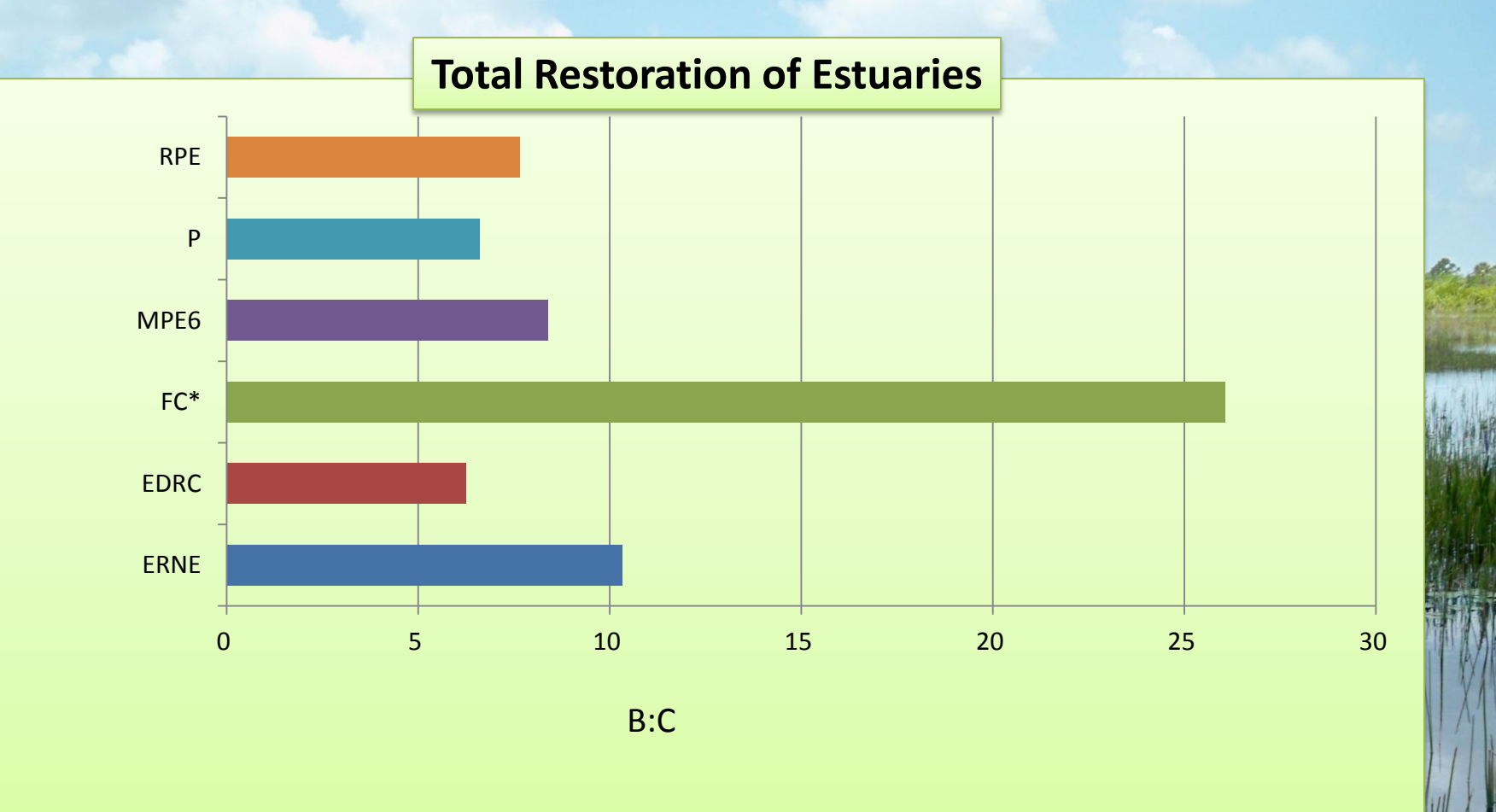
Figure 4. The benefit-to-cost ratio of configurations for the total restoration of affected estuaries. *Florida Crystals (FC) has the highest B:C ratio due to the absence of a deep water reservoir, resulting in a low capital and O&M cost.